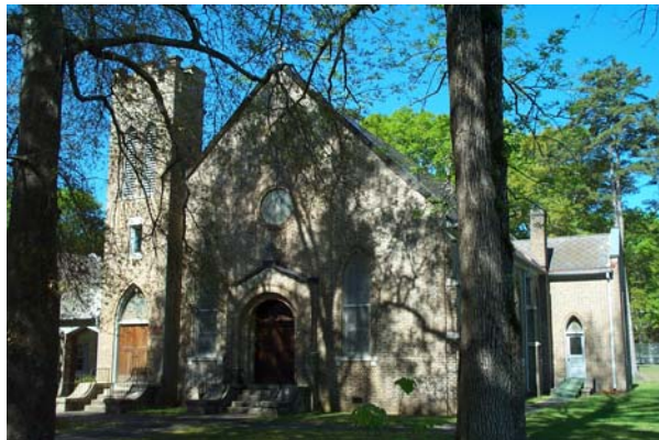
St. Stephen's Episcopal Church Ca. 1914